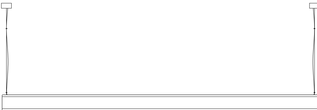
Dims: 2500 mm L, 130mm H, 75mm D Weight: 12.5kg