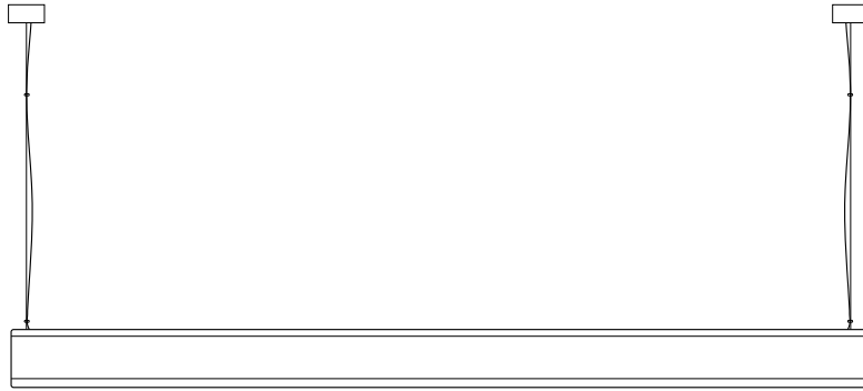
Dims: 1900 mm L, 130mm H, 75mm D Weight: 9.5kg